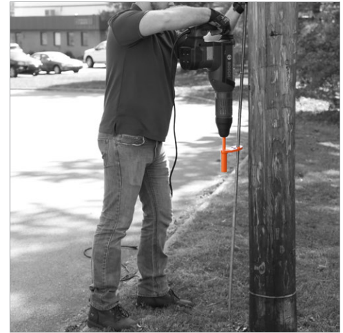
Safely drive rods from ground

Safely drive 1/2", 5/8", and 3/4" rods from the ground in under a minute with iTOOLco's Ground Rod Dawg™. Once rod is driven down far enough the tool will hammer from top to finish driving rod under grade levels from ground.