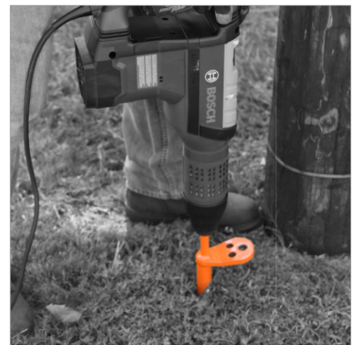
Fits 1/2", 5/8" and 3/4"