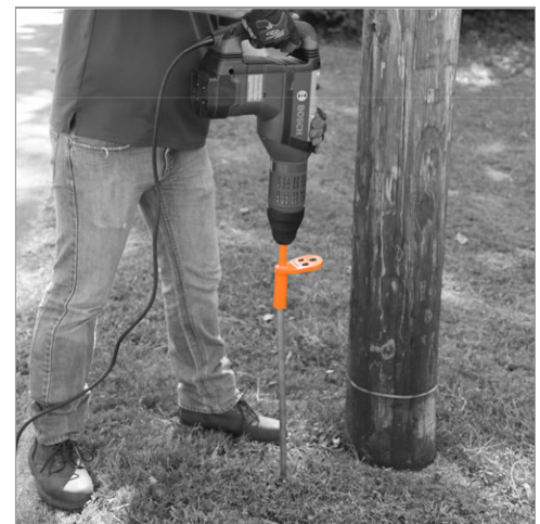
Tool locks into hammer drill