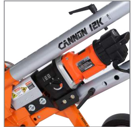
6 speed motor with reverse gear