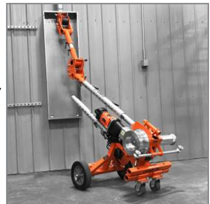
Use for overhead, underground, or side pulls

The fully self-contained, compact design of the Cannon 12K™ wire puller features the only 6-speed reversible motor that is sure to get even the heaviest pulls done in record time. Designed specifically for easy set up to meet job site demands, all parts store right on the puller. No gang box of parts needed. When extra extensions are used, the wire puller is capable of pulling out 13' of wire from the conduit opening. Gone are the days of pulling at only 6 feet per minute. iTOOLco's Cannon 12K™ pulls at speeds up to 48' per minute.