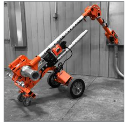
Customizable for each job site